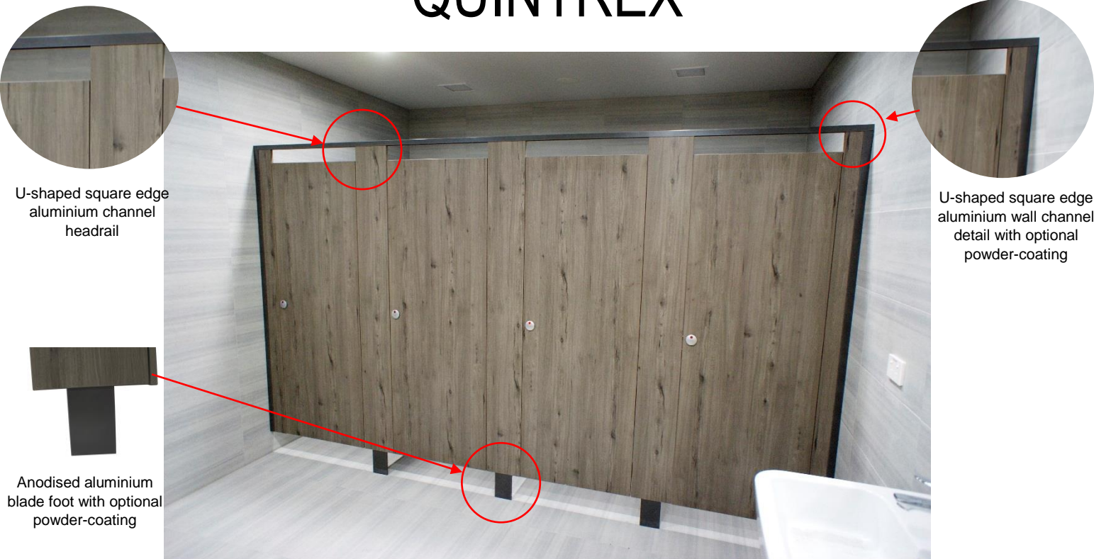
U-shaped square edge aluminium channel headrail