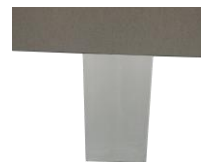
Anodised aluminium blade foot