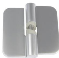
Concealed fix 106C emergency lift off gravity hinge