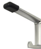
Concealed fix coat hook