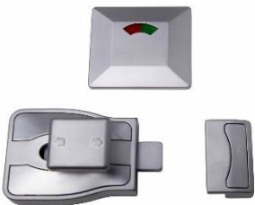
Concealed Square Moda Lock with Indicator and Door Stop