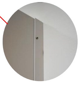
Continuous wall channels to all junctions