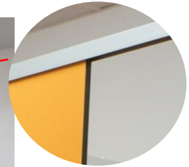
Silver anodised aluminium channel headrail