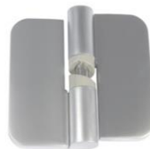
Concealed fix 106C emergency lift off gravity hinge