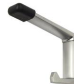
Concealed fix coat hook