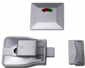
Concealed Square Moda Lock with Indicator and Door Stop