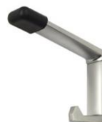
Concealed fix coat hook