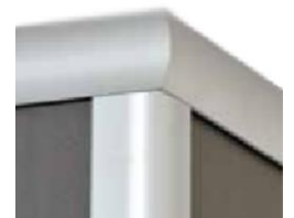
Anodised aluminium slimline headrail corner detail